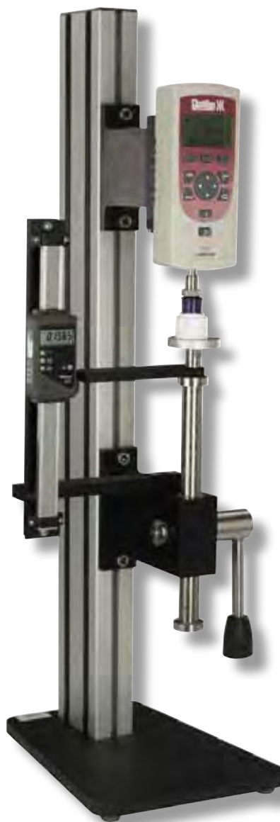
Shown: MT150L Series with optional Chatillon DFE Series digital force gauge and optional digital travel indicator.